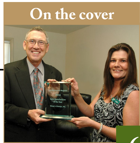
Cover photo by Geoffrey Blah Cover features: www.myfreestamps.com

Following a first-time win last year in the top category, Simon's Stamps returns as the 2014 Gold Manufacturer of the Year!